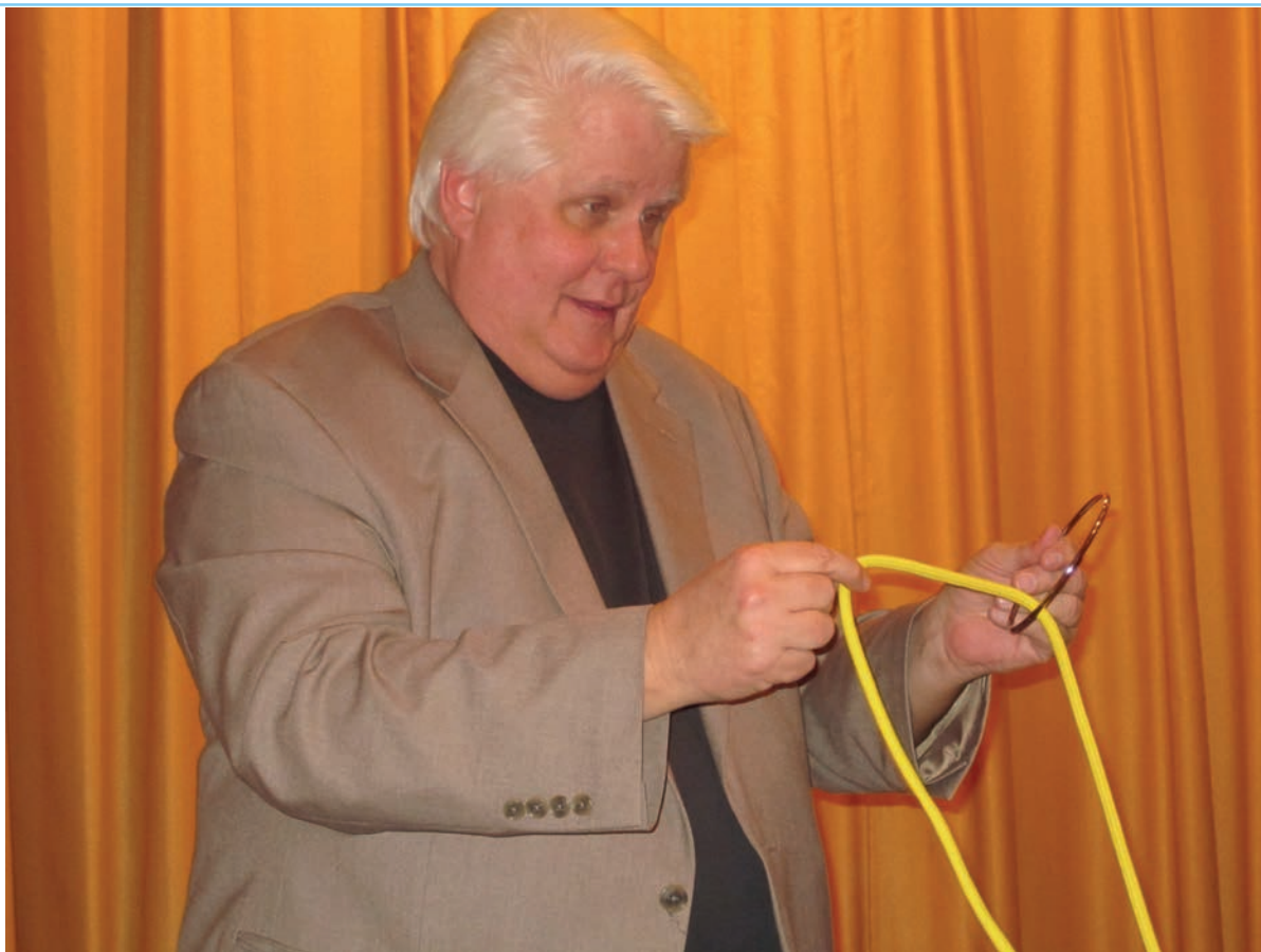
Slydini's Ring on Rope routine is a real fooler.