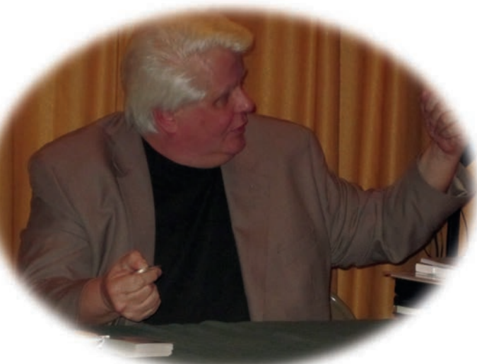
The Coins through the Table

Throughout the lecture Wisch noted the importance of angles while performing and how to use them to your advantage. His demonstration of how to use one's elbow as a servante was not only clever, but provides a great way to perform the Balls to Box or torn