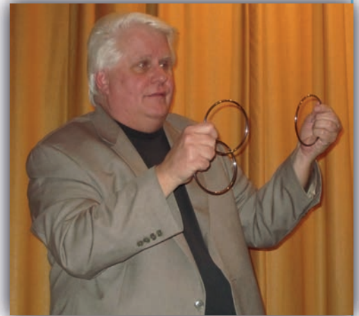
Linking Rings a la Slydini

related to it. He described how Slydini taught him to talk to himself as he performed to help