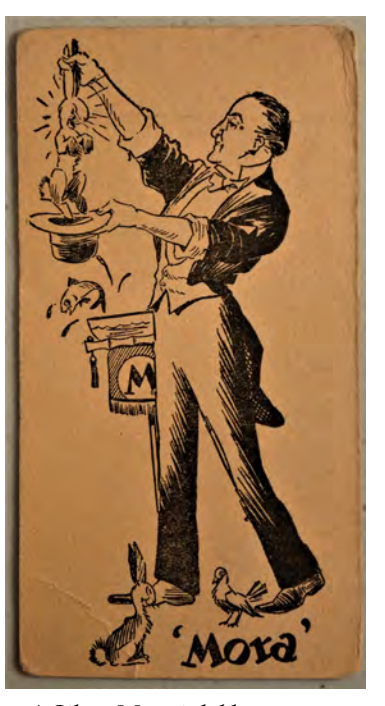
A Silent Mora ink blotter.

Most Saturdays lately, I have been perusing the less visible aspects of Ray's collection. The volume of material is mindboggling. It's like an archaeological expedition.