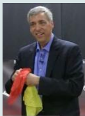
Author: Pat Farenga