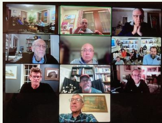
Zoom Crew for our first hybrid meeting!