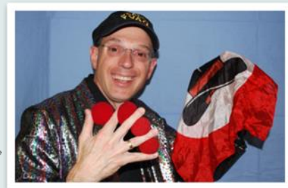
IBM Ring 122 President