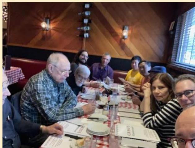
A cadre of magicians enjoying some early bird dinner at Greg’s Restaurant.

Connecting with local magicians is one of the things that make our club special, and on Sunday, 8/27/23, we will be having our summer BBQ at Camp Evergreen. This year, I am actively trying to get both local SAM chapters involved with the BBQ so we can have more people and more fun! I hope to have much more information about the BBQ/Auction/and Show in next month’s Silent Messenger.